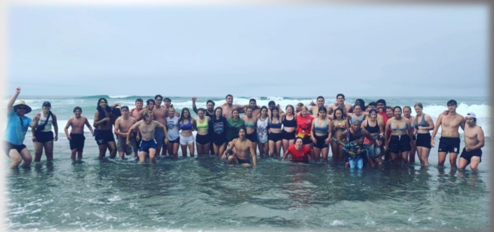
Thunder, California Tour 2022